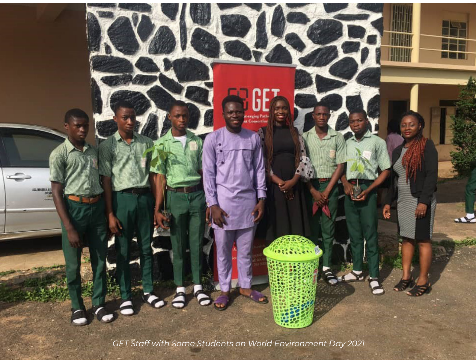
GET Staff with Some Students on World Environment Day 2021

Plant a Tree Today, Save our Earth for our Future Generation!