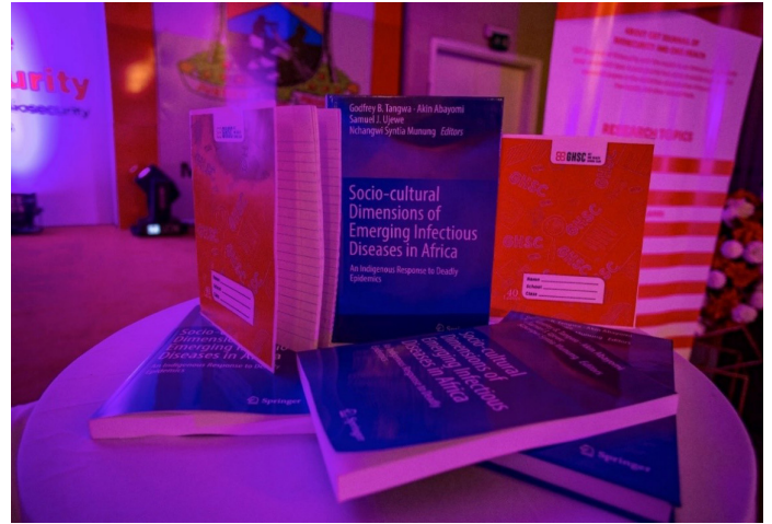
Display of GET Journal Banner, GET One Health School Club (GHSC) Project materials, and GET Book titled 'Socio-Cultural Dimensions of Emerging Infectious Diseases in Africa'