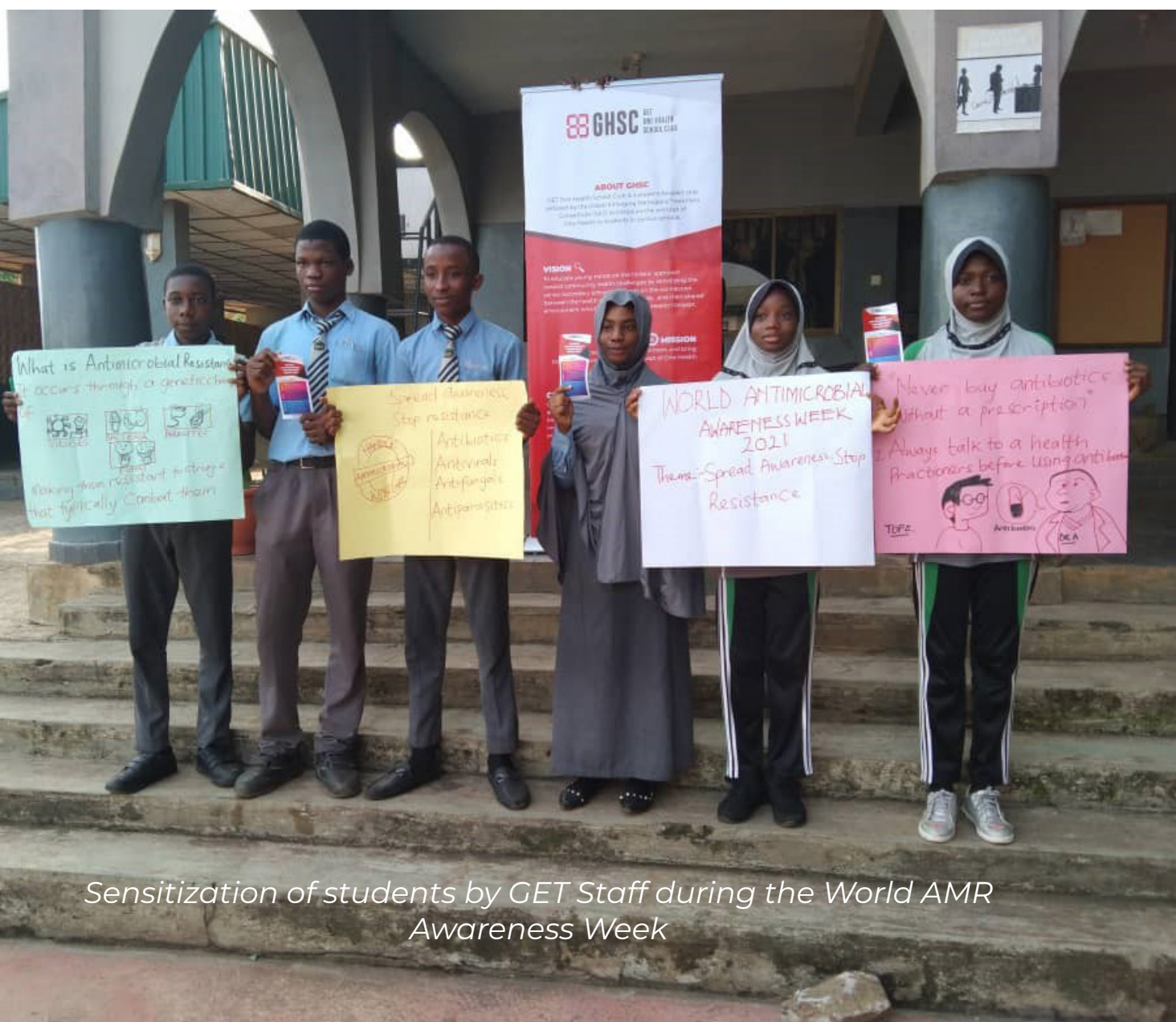
Sensitization of students by GET Staff during the World AMR Awareness Week

GET had the awareness programme done through the GET One Health School Club (GHSC) Project.