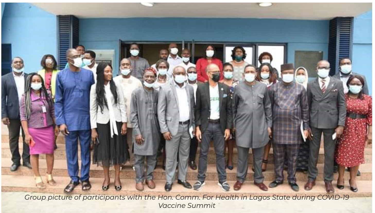
Group picture of participants with the Hon. Comm. For Health in Lagos State during COVID-19 Vaccine Summit

The COVID-19 Vaccine Summit Communique can be downloaded via: https://www.getafrica.org/resources/getcommuniques/