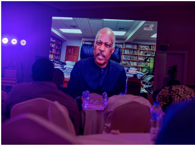
The 8th Vice-Chancellor of the University of West Indies (The UWI), Prof. Sir Hilary Beckles during his virtual presentation at the 7th African Conference