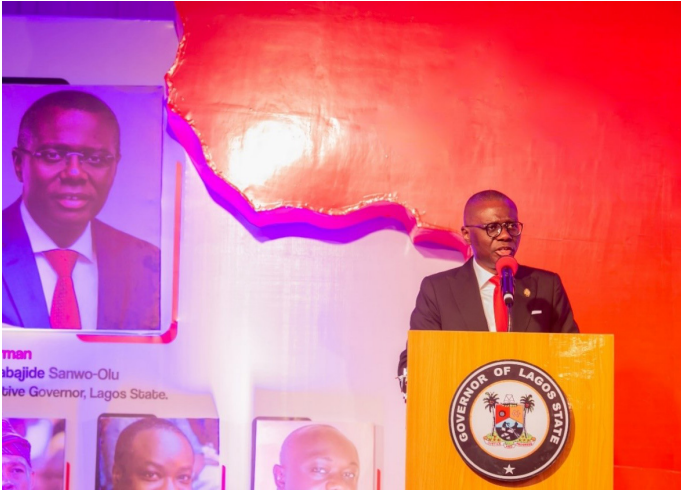
The Executive Governor of Lagos State, Mr. Babajide Sanwoolu giving a welcome speech at the 7th African Conference