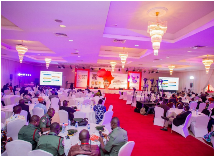
Aerial view of participants seated at the conference