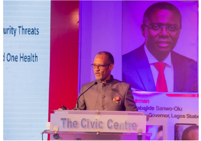
The Honorable Commissioner for Health, Lagos State, Prof. Akin Abayomi giving a presentation at the 7th African Conference.