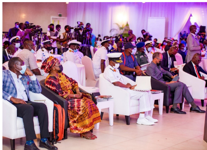
Side view of important dignitaries seated at the conference