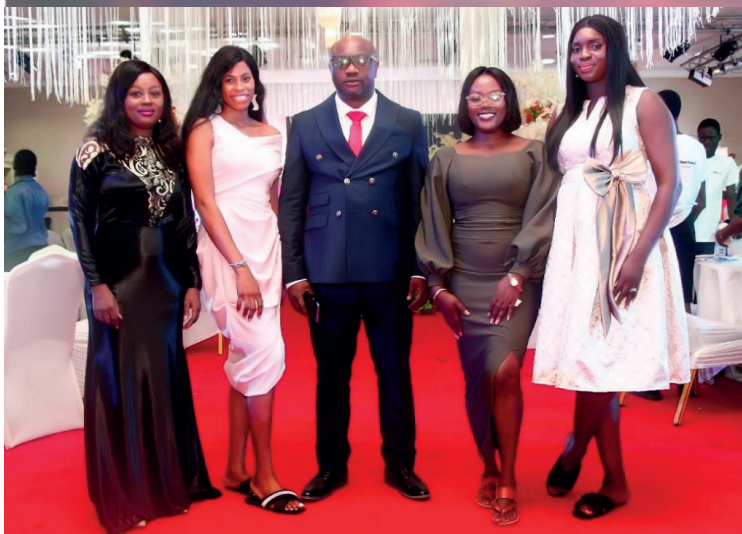
GET Staff at GET Dinner/Awards Night