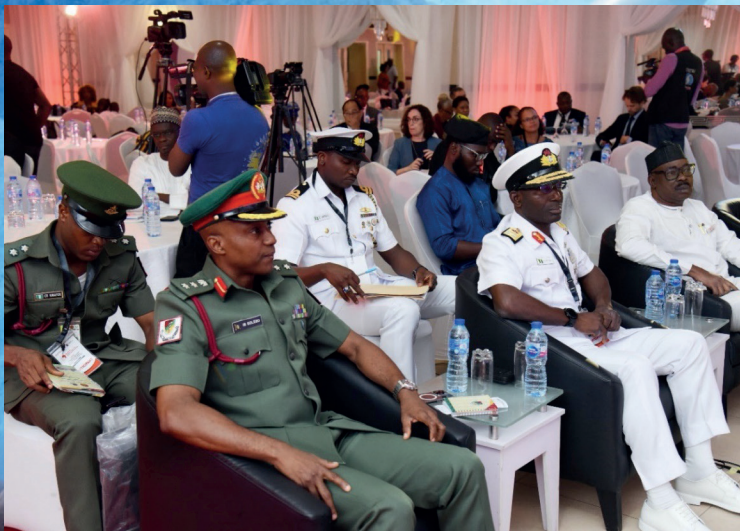
Participants seated at the 8th African Conference