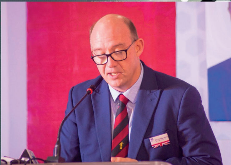
Ben Llewellyn-Jones, British Deputy High Commissioner (DHC) giving a goodwill message