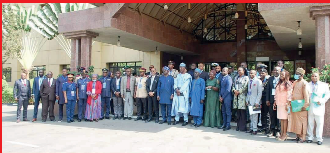
TRAINING ON BIO-RISK MANAGEMENT AND PUBLIC HEALTH EMERGENCY PREPAREDNESS @ REIZ CONTINENTAL HOTEL ABUJA. DATE: 24-28 JANUARY, 2022