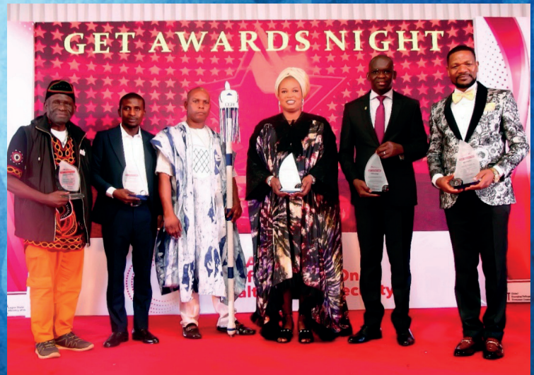
Awardees at GET Dinner/Awards Night