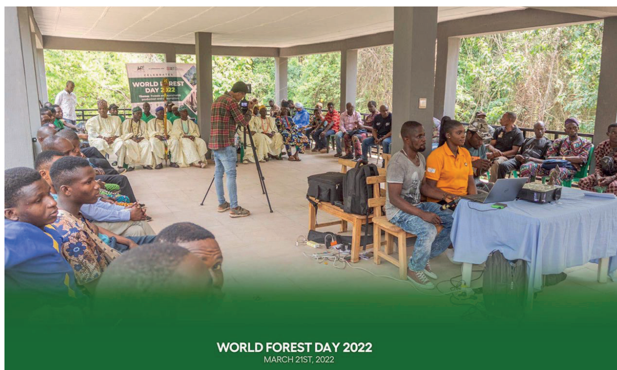
Participants seated at the World Forest Day 2022 programme

Watch the video of the event on GET Youtube page via https://youtu.be/3hdiJaahMZg