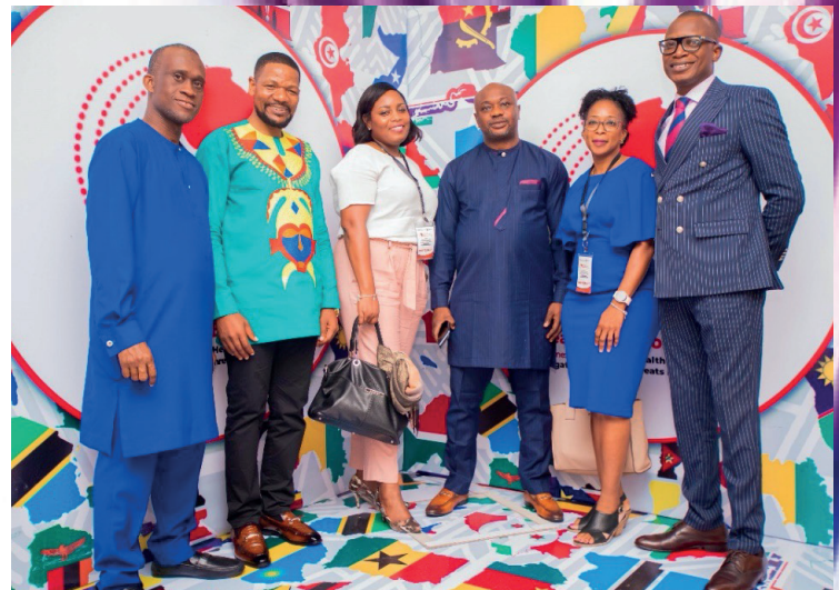
Participants at the Conference