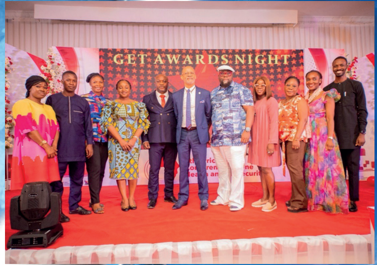
Commissioner for Health in Lagos State with the Staff of Lagos State Ministry of Health