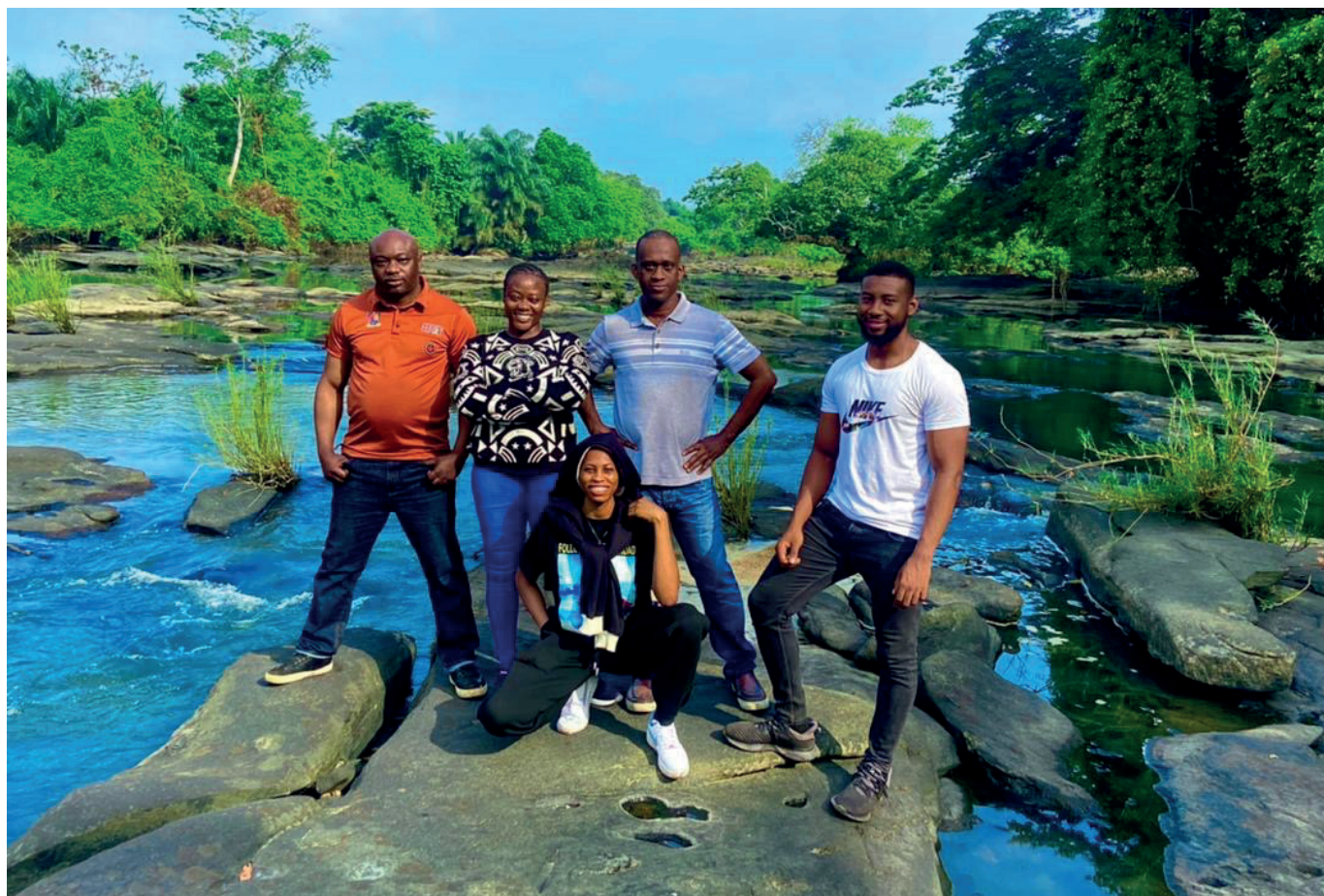
GET staff at the Emerald Forest

During the retreat, the team engaged in activities such as a forest tour, a visit to the Osun River within the Emerald Forest, games, life skills etc.