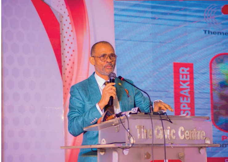
The Honorable Commissioner for Health, Lagos State, giving his presentation at GET Conference