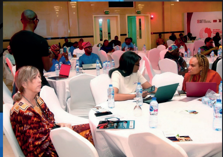
Participants seated at the Conference