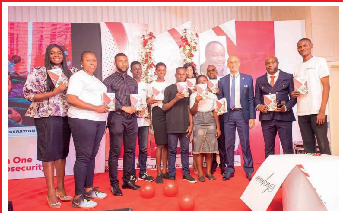
The GHSP Students with the Commissioner for health and GET staff during the book launch